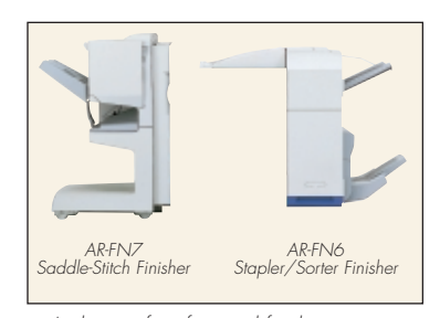
A choice of professional finishing options makes it easy to produce booklets, reports, and more in house.

➤ Optional Two-Tray Finisher or Saddle-Stitch Finisher which offers 3-position stapling, center folding, and 50-sheet stapling capacity